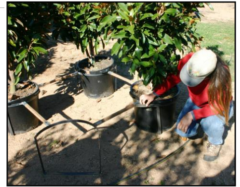
Large - Split ring with strap (15 to 25 gallon)