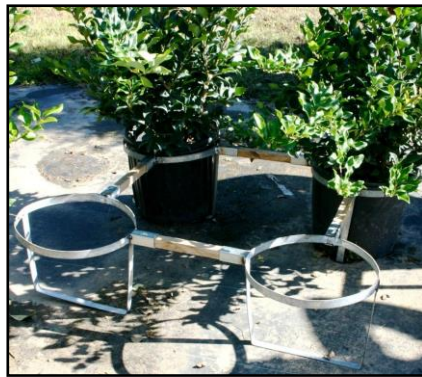
Small - Full rings (1 to 10 gallons)

These photos show newest concept for container support. Galvanized steel rings and stands can be configured into rings of four or other shapes shown. The large sizes are split rings for 15, 20, and 25 gallon sizes, while the six smaller sizes have full rings for 1 to 10 gallon sizes